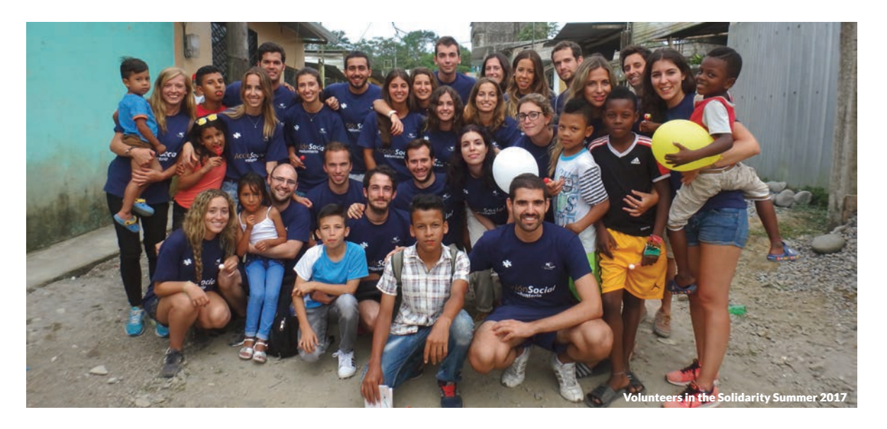
The Firm encourages and supports initiatives for solidarity carried out by its professionals

Since the Social Action Group was first created, Management Solutions professionals have conducted numerous activities in association with various NGOs and charities.