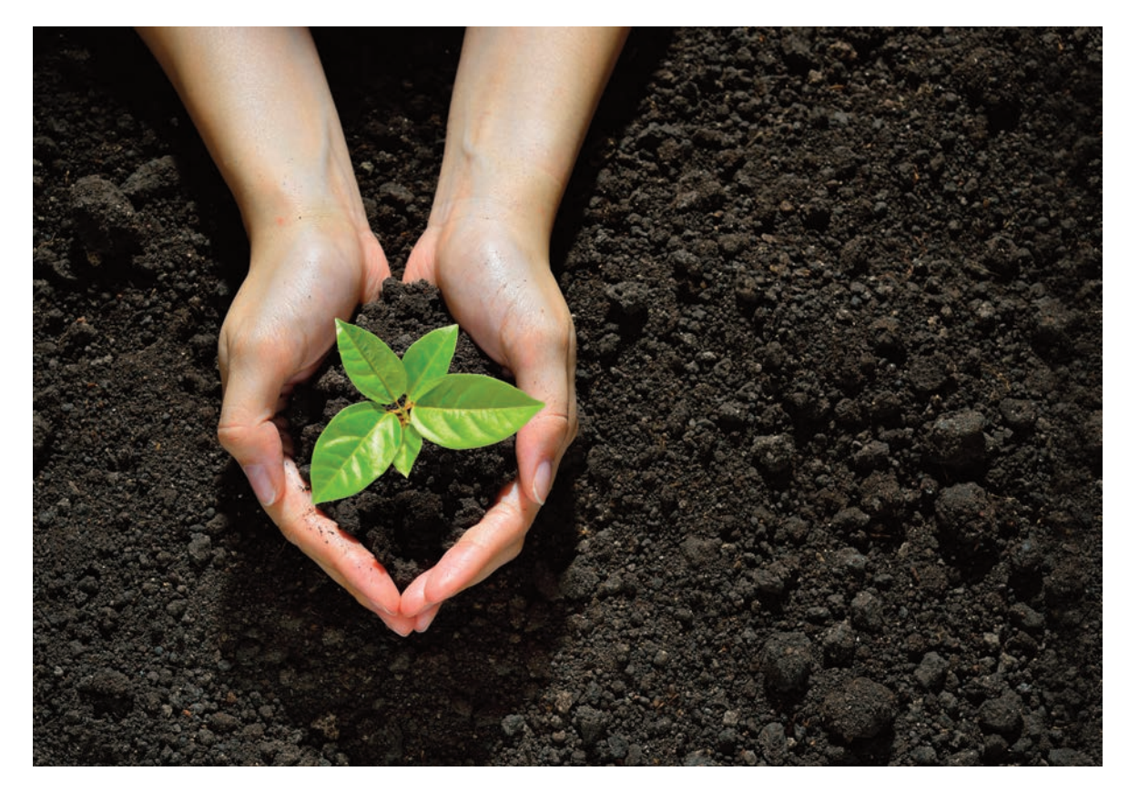
We are particularly sensitive to any environmental impact that may be caused by our activity

The unprecedented mobilization of the public and private sectors to reduce the impact of human activity on the planet underscores the criticality of addressing environmental issues and reducing the climate impact of our society.