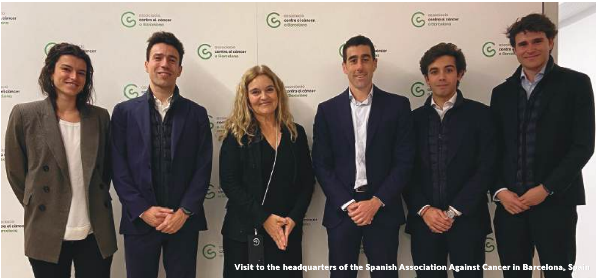
Visit to the headquarters of the Spanish Association Against Cancer in Barcelona, Spain

Management Solutions has collaboration agreements with several schools in Madrid, allowing students to gain their first experience in a professional environment. In 2024, students from Everest School, Highlands Los Fresnos and the British School had the opportunity to visit one of the Firm's offices in Madrid for three days. Through meetings with professionals of different profiles and positions, the students had the opportunity to learn first-hand about the Firm's activities, mission and objectives, the values shared by its professionals and the industries in which the Firm operates, as well as seeing the different types of projects developed and carrying out a case study on consulting in the financial sector.