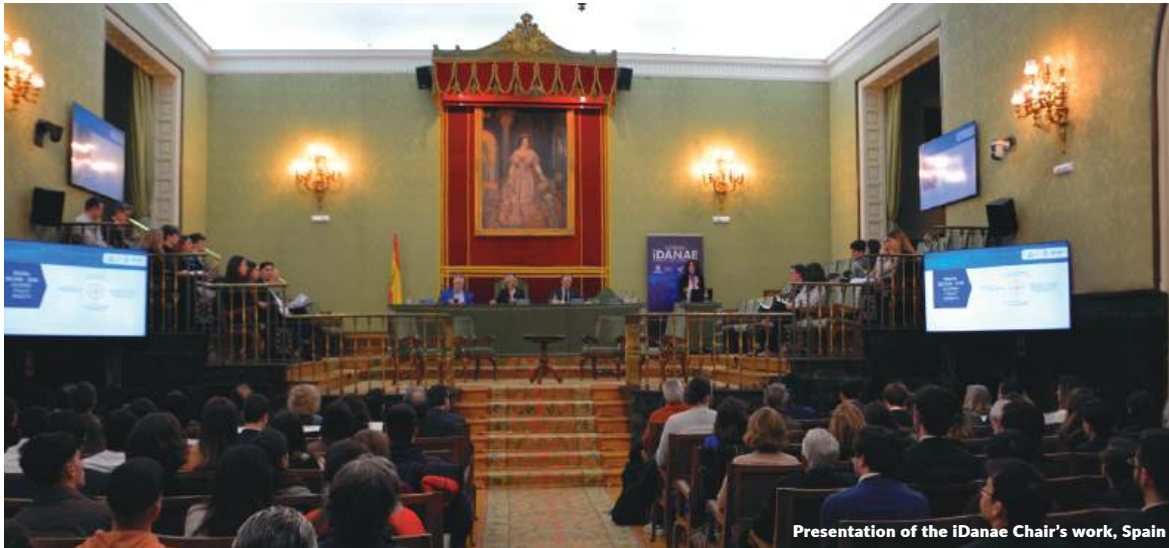
Presentation of the iDanae Chair's work, Spain