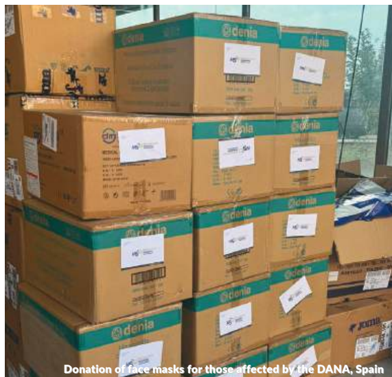
Donation of face masks for those affected by the DANA, Spain