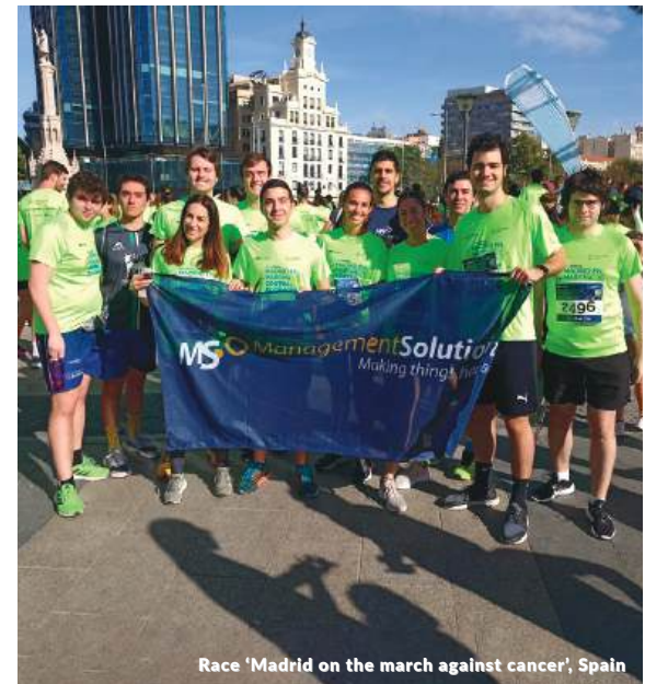
Race 'Madrid on the march against cancer', Spain