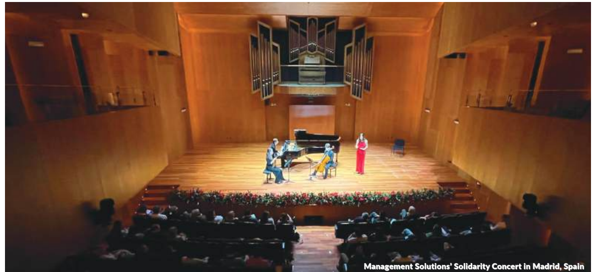
Management Solutions' Solidarity Concert in Madrid, Spain

The Firm supports and encourages actions developed by its professionals to support good causes