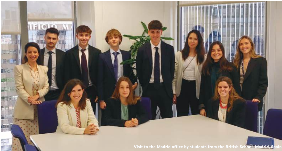
Visit to the Madrid office by students from the British School, Madrid, Spain

The Spanish Association Against Cancer is a non-profit organization that has been working in the fight against cancer for more than 70 years, offering support to patients and their families, promoting prevention and health education programs, accompanying patients and their families, and financing cancer research projects that will allow for better cancer diagnosis and treatment.