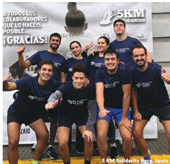
5 KM Solidarity Race, Spain

Under the slogan "Wetlands connect us with the nature of the city", the race aimed to run for the forests and wetlands of the country - since for each runner registered in the race, three trees are planted under the ecological restoration scheme, in nature reserves, in perpetuity, as well as to raise awareness of the need to recover the forests and respect for the environment.