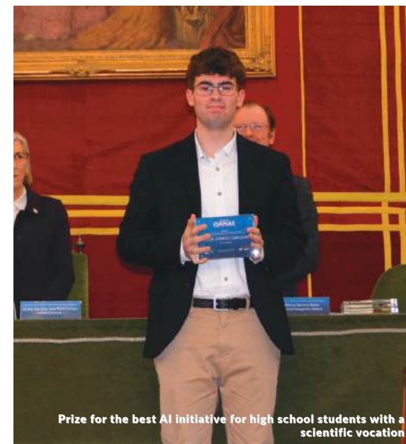
Prize for the best AI initiative for high school students with a scientific vocation