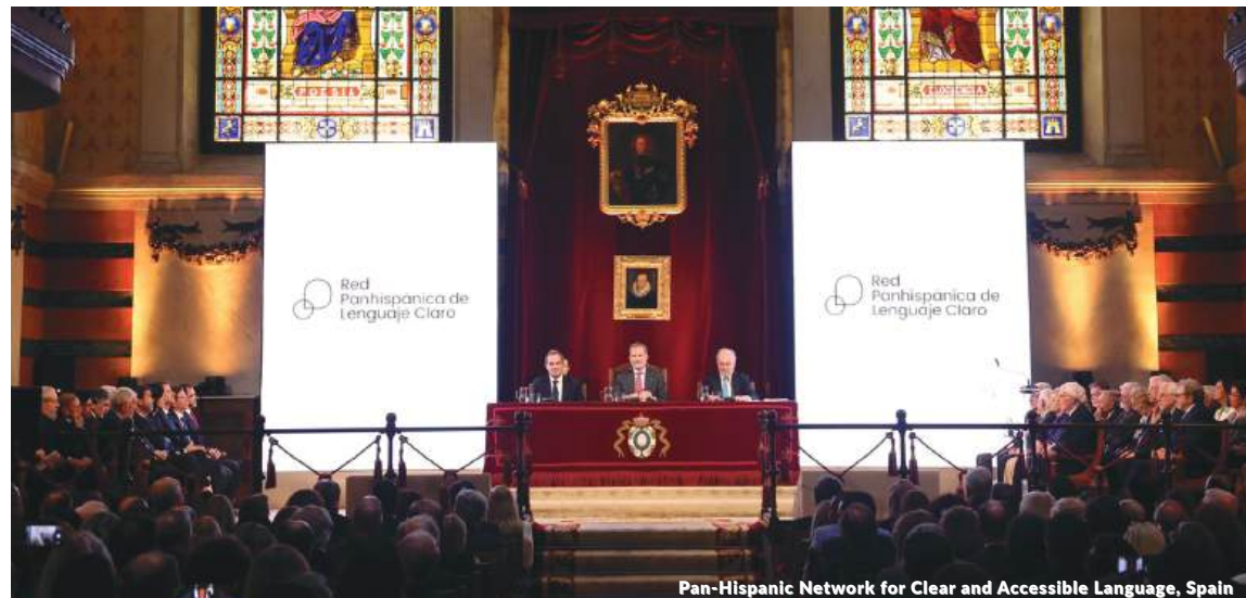
Pan-Hispanic Network for Clear and Accessible Language, Spain

The Pan-Hispanic Network for Clear Language is an initiative of the Royal Spanish Academy (RAE), with which Management Solutions collaborates through the Pro-RAE Foundation, and has two essential purposes: to promote clear and accessible language as the foundation of democratic values and citizenship, and to promote the commitment of the authorities to ensure this in all areas of public life. To fulfill these aims, the Network aims to integrate all current and future initiatives in defense of the fundamental right of citizens to understand the basic laws and regulations governing social coexistence. It also aspires to incorporate projects in favor of language accessibility.