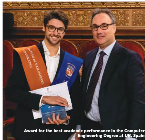
Award for the best academic performance in the Computer Engineering Degree at UB, Spain

The prize, awarded for his work "Data process monitoring system for industrial environments based on cloud services", sought to recognize the most innovative Master's Thesis within the field of digital transformation, evaluating in particular the technologies proposed, the innovativeness of the solutions obtained and their application in the business world.