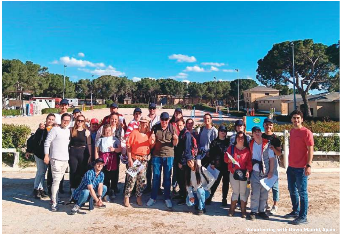
Volunteering with Down Madrid, Spain

Management Solutions has signed several cooperation agreements with various foundations and organizations that promote charitable, entrepreneurship and social integration causes