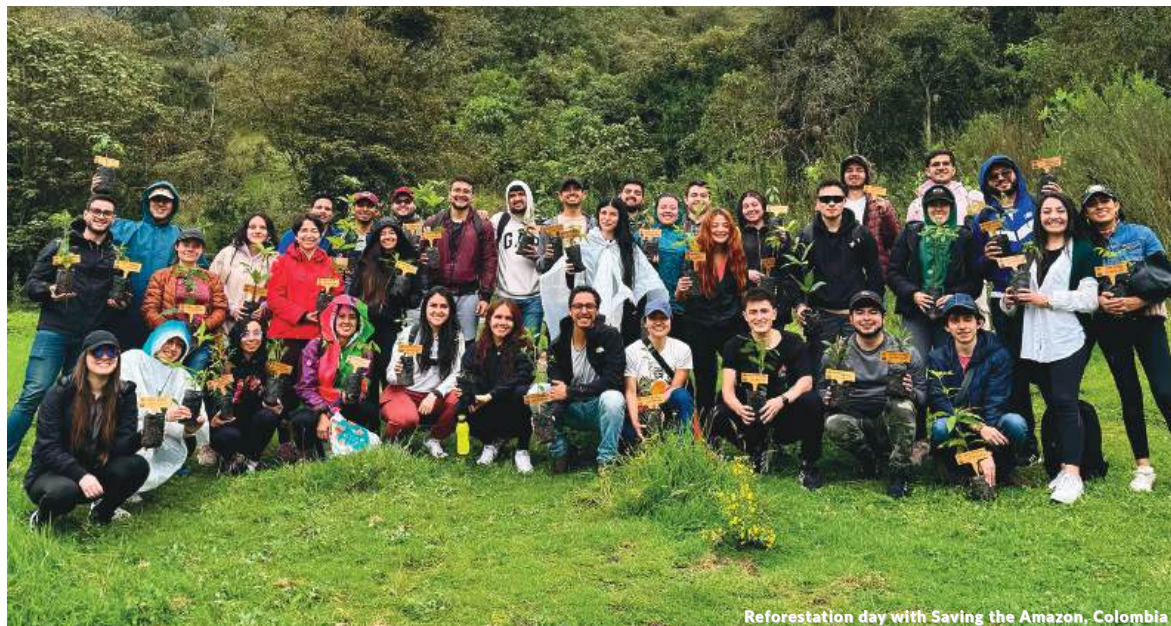
Reforestation day with Saving the Amazon, Colombia

The Spanish Association Against Cancer is an NGO founded in 1953 that brings together patients, family members, volunteers and professionals who work together to prevent, raise awareness, support people and finance cancer research projects that will lead to better diagnosis and treatment of cancer.