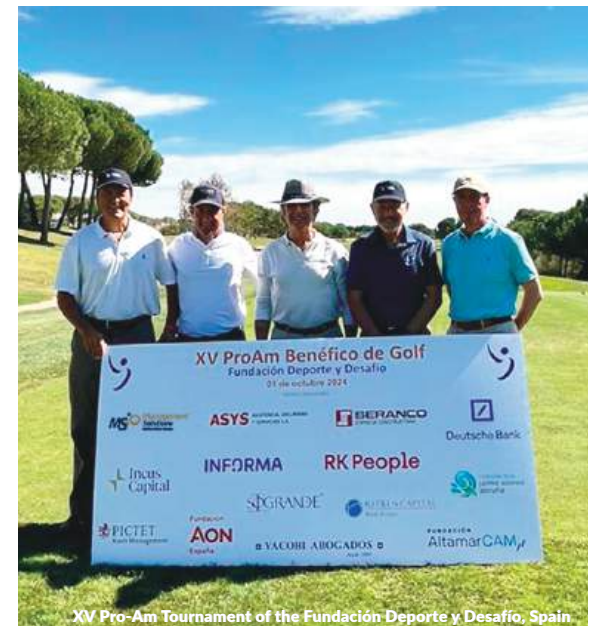
XV Pro-Am Tournament of the Fundación Deporte y Desafío, Spain