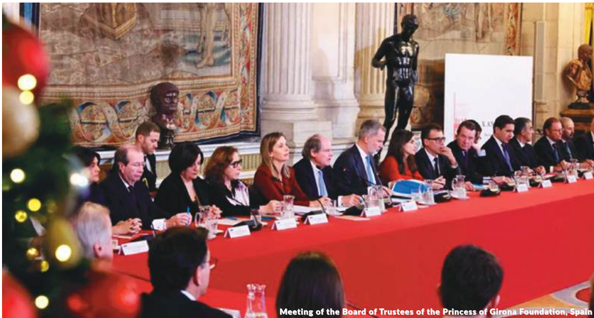
Meeting of the Board of Trustees of the Princess of Girona Foundation, Spain

The main objectives of this new association are to act as a meeting point and provide a forum for debate on the systems and methods used to manage, monitor, analyze and measure the risks arising from financial activity. The association also acts to foster the exchange of ideas, experiences and opinions on best practices in this field. Its objectives also include maintaining close contact with regulatory authorities and other bodies pursuing the same goals, and disseminating knowledge through the organization and development of FRM (Financial Risk Manager) training programs and internet courses.