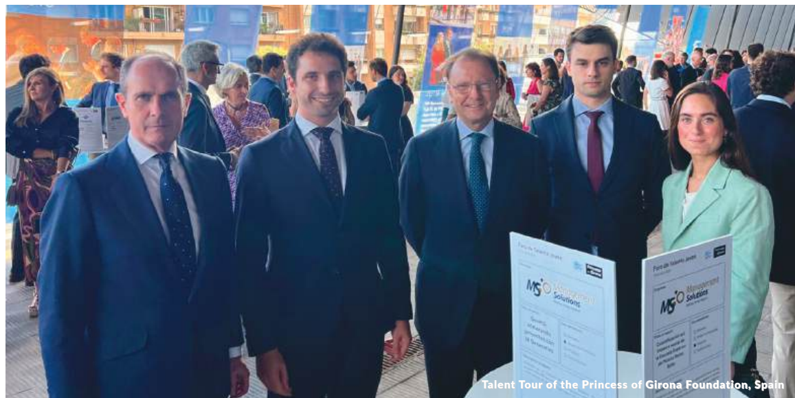
Talent Tour of the Princess of Girona Foundation, Spain

During the event, in which 150 young people from 40 of the companies that form part of the Board of Trustees participated, Management Solutions professionals presented projects related to artificial intelligence (GenMS: accelerating projects with Generative AI) and sustainability (Quantifying the social impact of the Reina Sofía School of Music), highlighting the Firm's experience in both fields.