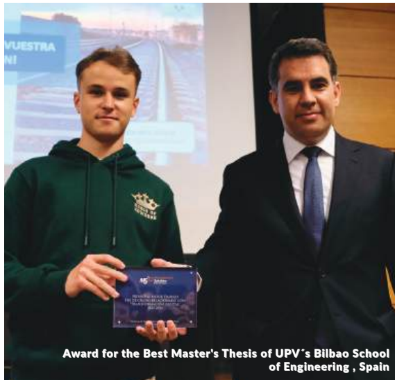
Award for the Best Master's Thesis of UPV's Bilbao School of Engineering , Spain