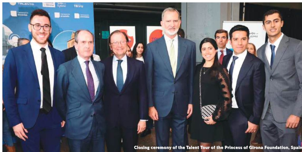
Closing ceremony of the Talent Tour of the Princess of Girona Foundation, Spain

During the event, the International CreaEmpresa and Research Awards were presented to two young people from Guatemala and Argentina and the Talent Tour 2024, which for five months has promoted closer links between students and the labour market and employment, came to an end.