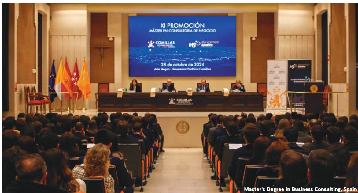
Master's Degree in Business Consulting, Spain

In fiscal year 2024, more than 200 students completed non-labor training internships at the Firm. These internships allow the students selected by the Firm to have a first contact with the business world and to learn different technical subjects and acquire the necessary skills to tackle consulting problems.