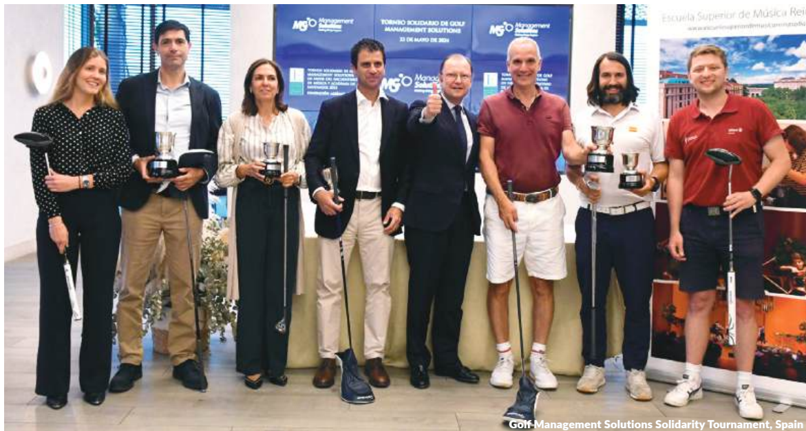
Golf Management Solutions Solidarity Tournament, Spain

The Social Action Group once again organized volunteering events in collaboration with the Leisure Area of Down Madrid, an association that helps to improve the quality of life of people with intellectual disabilities. During these initiatives, Management Solutions volunteers were able to share a fun afternoon at an equestrian center with a group of young people with Down syndrome and other intellectual disabilities.