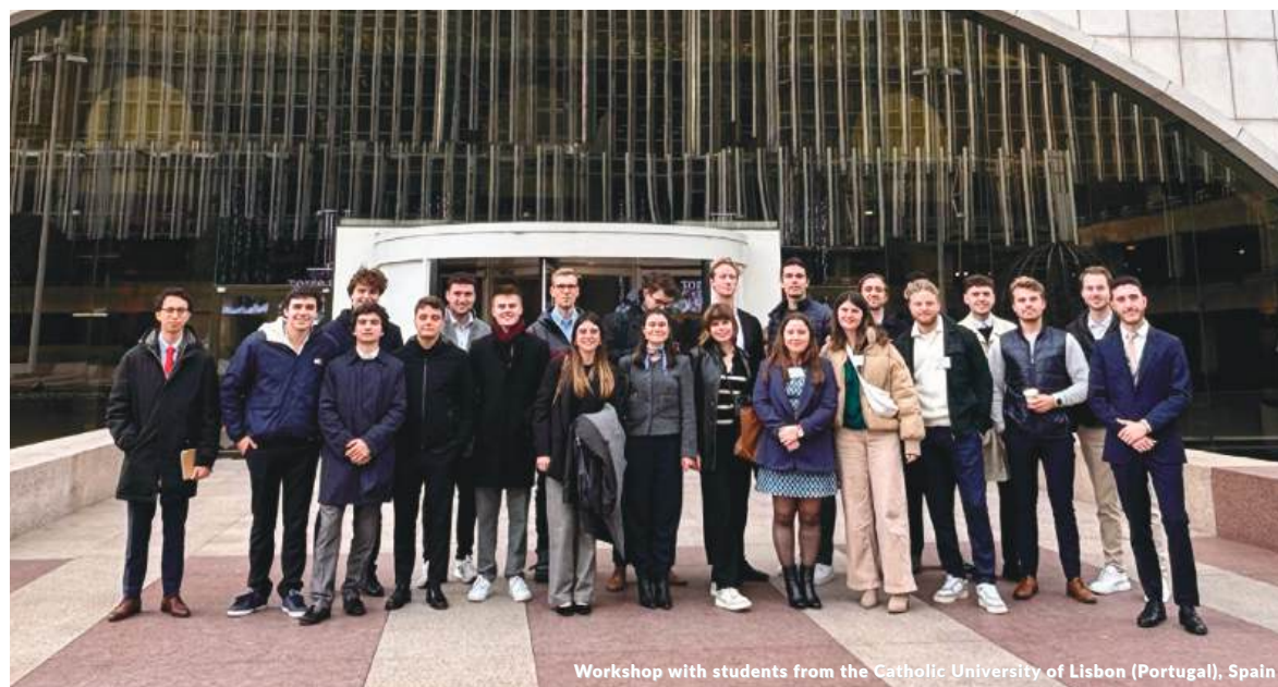
Workshop with students from the Catholic University of Lisbon (Portugal), Spain

During the event, students were able to learn first-hand about how our Firm works, what we do and how we do it, explore opportunities for professional growth aligned with their ambitions, and learn directly about the current challenges of business management.