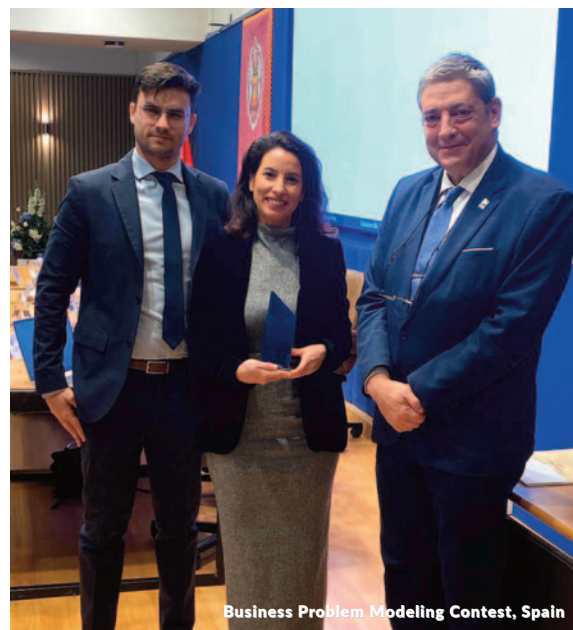
Business Problem Modeling Contest, Spain