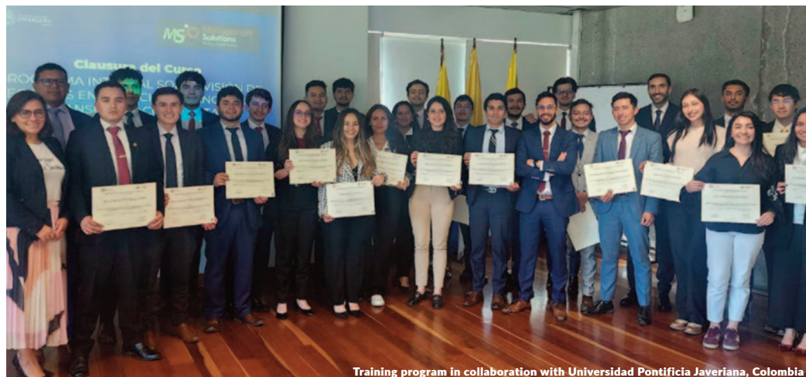
Training program in collaboration with Universidad Pontificia Javeriana, Colombia

These initiatives helped reinforce Management Solutions' positioning in the Latin American university environment.