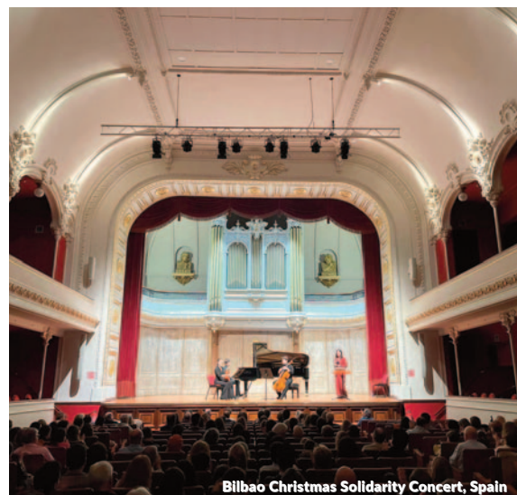
Bilbao Christmas Solidarity Concert, Spain