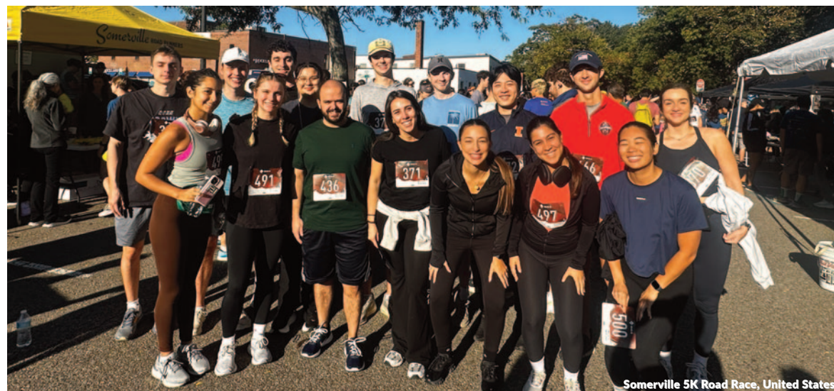
Somerville 5K Road Race, United States

The Casas da Criança de Santo Amaro are centers that take in underprivileged children up to the age of 17, providing them with food, health care, extracurricular courses, socio-educational activities and qualifications to help them enter the job market.