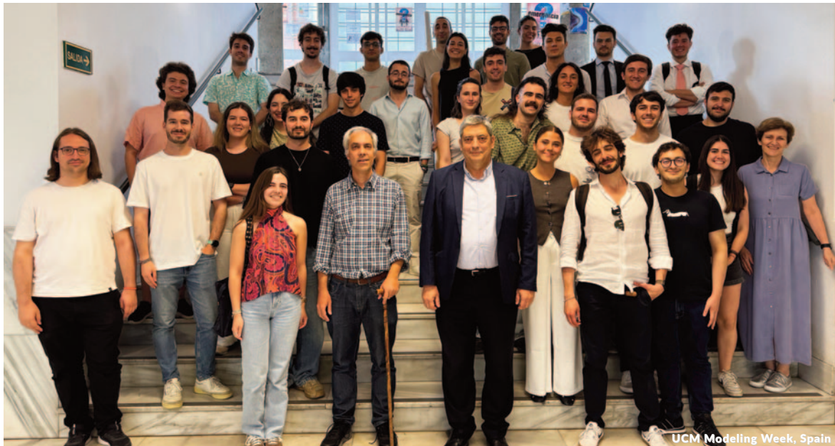
UCM Modeling Week, Spain

In this edition, Management Solutions proposed a practical challenge with a high social impact in the healthcare field, focused on designing an AI assistant to support clinical decision-making in the treatment of rare diseases. The task involved developing a solution based on generative AI