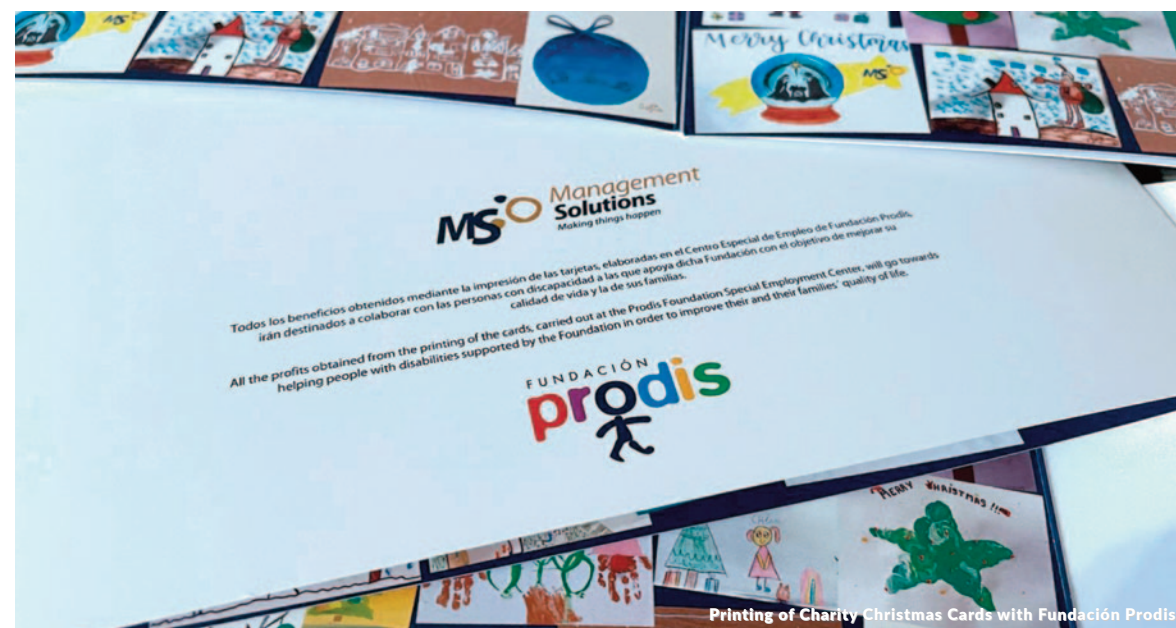
Printing of Charity Christmas Cards with Fundación Prodis

Under this agreement, Management Solutions will collaborate with Inserta Empleo—the ONCE Foundation's training and employment agency—to identify suitable candidates, conduct pre selection processes aligned with