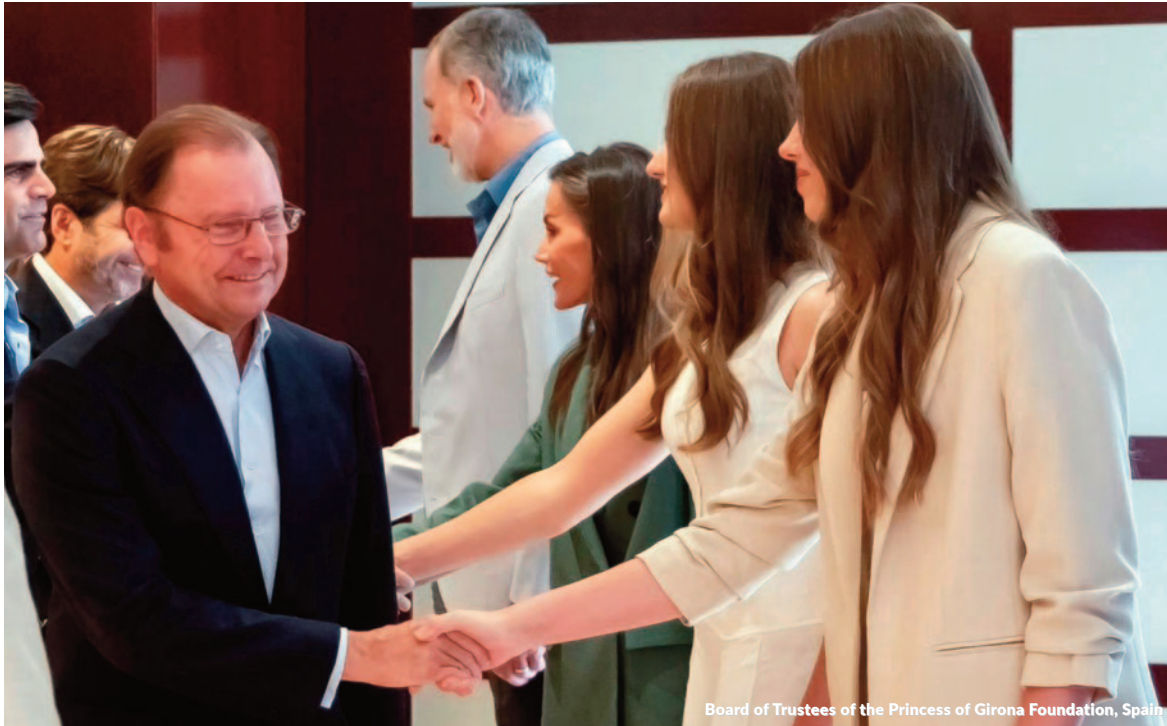
Board of Trustees of the Princess of Girona Foundation, Spain