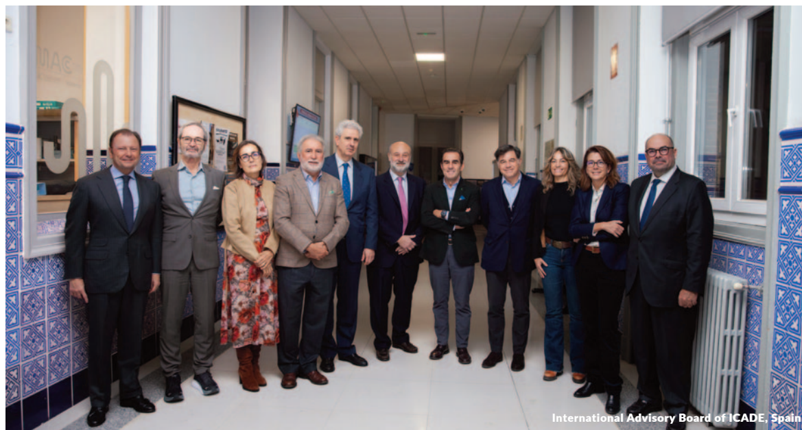
International Advisory Board of ICADE, Spain