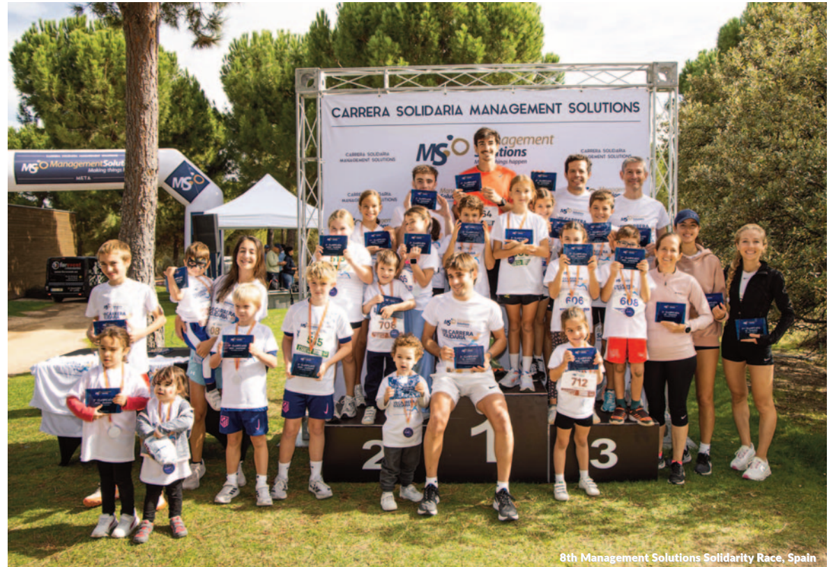
8th Management Solutions Solidarity Race, Spain

The Firm supports and encourages initiatives carried out by its professionals in support of good causes