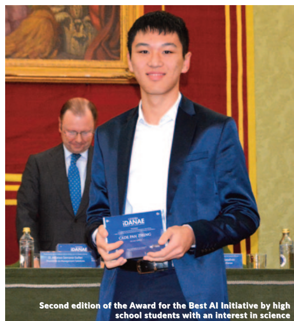
Second edition of the Award for the Best AI Initiative by high school students with an interest in science

During the year, the Chair organized other notable activities, including a training session for high school students on the fundamentals of AI adoption in companies and current trends in AI, held at the International Training Hub of Management Solutions in collaboration with students from the ESTALMAT mathematical talent program of the Royal Academy of Exact, Physical, and Natural Sciences (RAC).