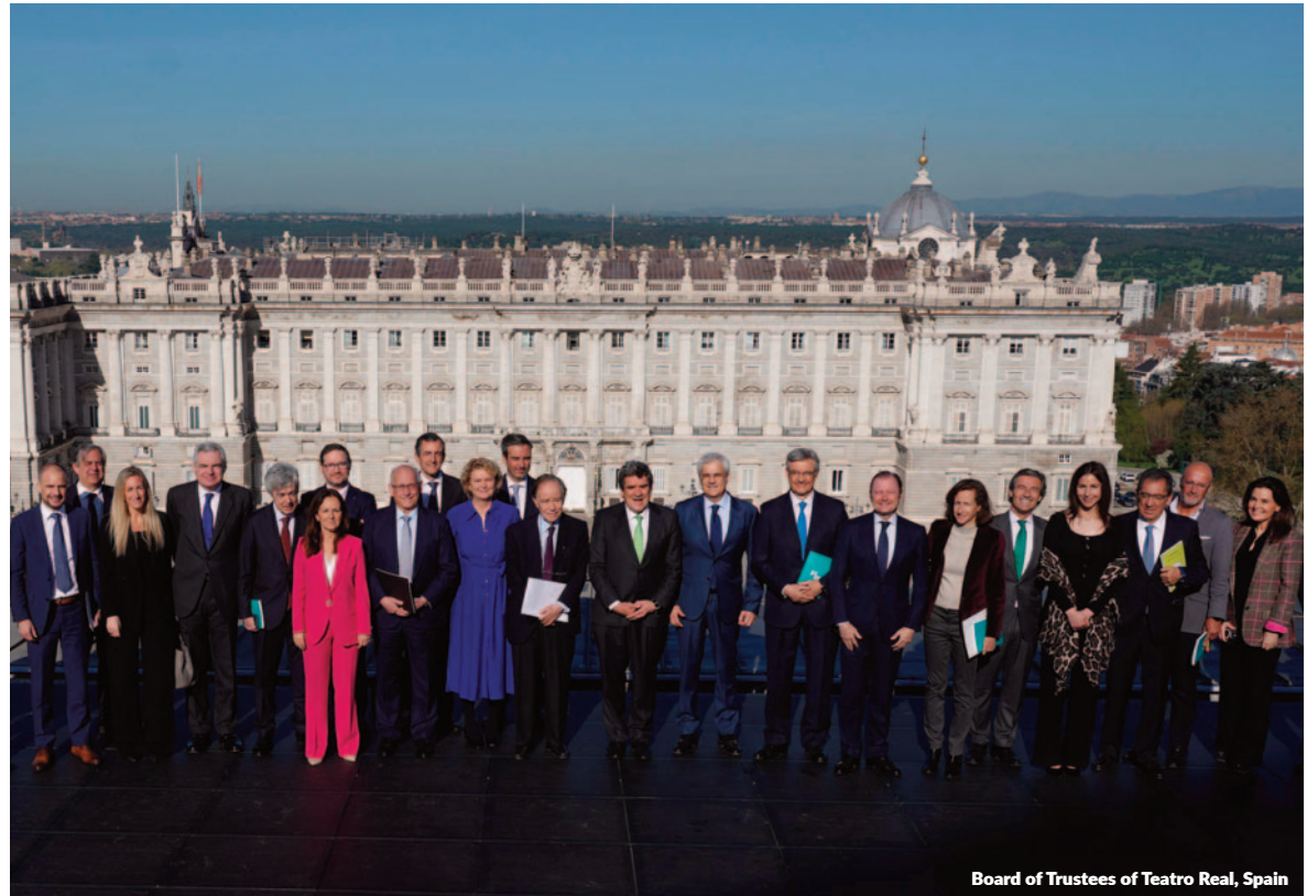
Board of Trustees of Teatro Real, Spain

The Firm maintains an active policy of sponsorship and patronage