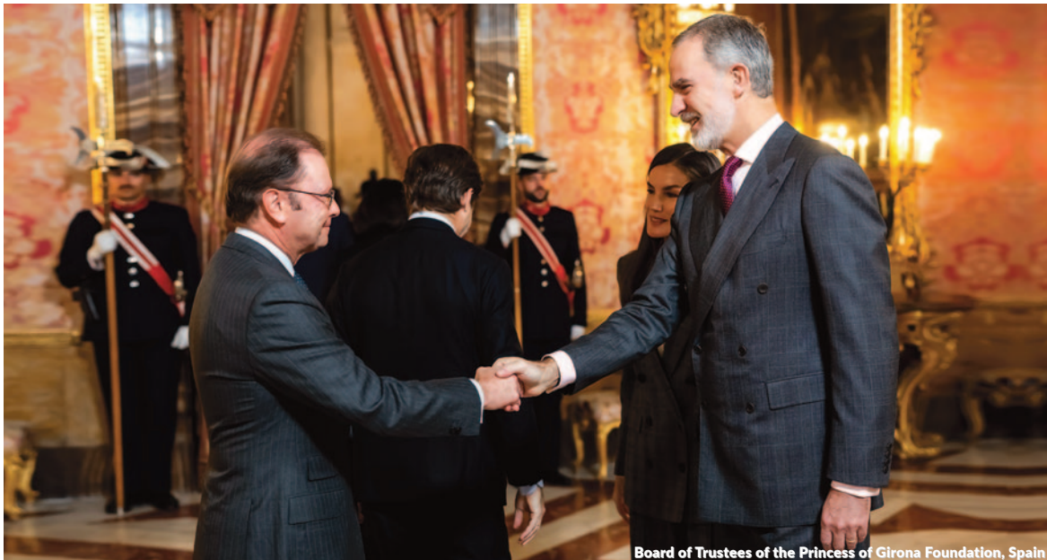
Board of Trustees of the Princess of Girona Foundation, Spain

Thanks to the support and financial contribution of its members, this Club has managed to sustain its activity for over 20 years in four broad areas: energy know-how, training, publications and on-line dissemination.