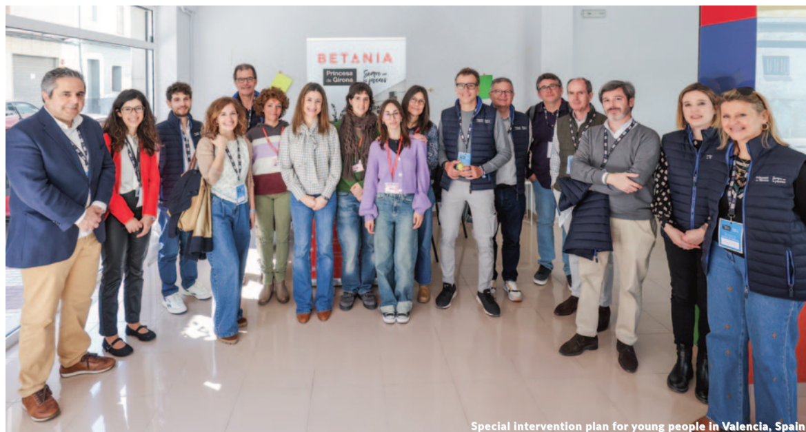
Special intervention plan for young people in Valencia, Spain