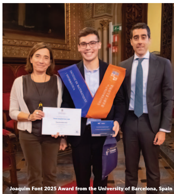
Joaquim Font 2025 Award from the University of Barcelona, Spain