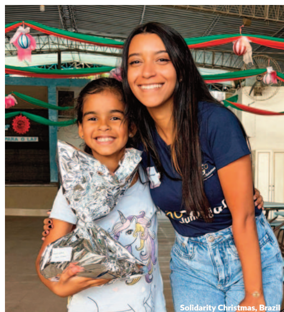
Solidarity Christmas, Brazil

Nearly 150 people took part in the Unmatched Socks challenge, which involved wearing different socks on each foot and sharing a photo on social media. The goal was to raise awareness, give visibility to people with Down syndrome, and highlight the importance of autonomy. The initiative also had a second positive impact: the Firm gifted all participants a pair of solidarity socks from the Down Madrid Foundation (produced at its Achira Special Employment Center), ASDRA (Down Syndrome Association of Argentina), and other partner organizations.