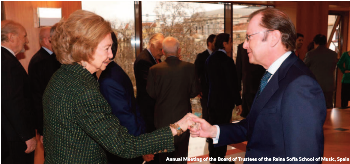
Annual Meeting of the Board of Trustees of the Reina Sofía School of Music, Spain