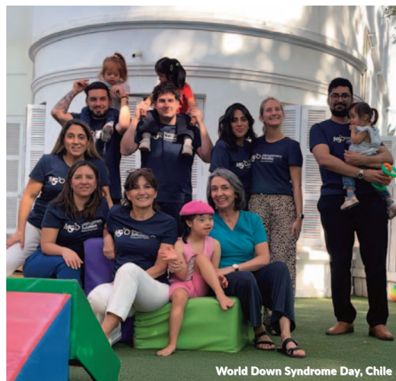
World Down Syndrome Day, Chile