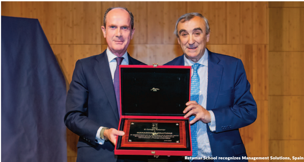
Retamar School recognizes Management Solutions, Spain

The Spanish Association Against Cancer is a non-profit organization that has been working in the fight against cancer for more than 70 years, offering support to patients and their families, promoting prevention and health education programs, accompanying patients and their families, and financing cancer research projects that will allow for better cancer diagnosis and treatment.