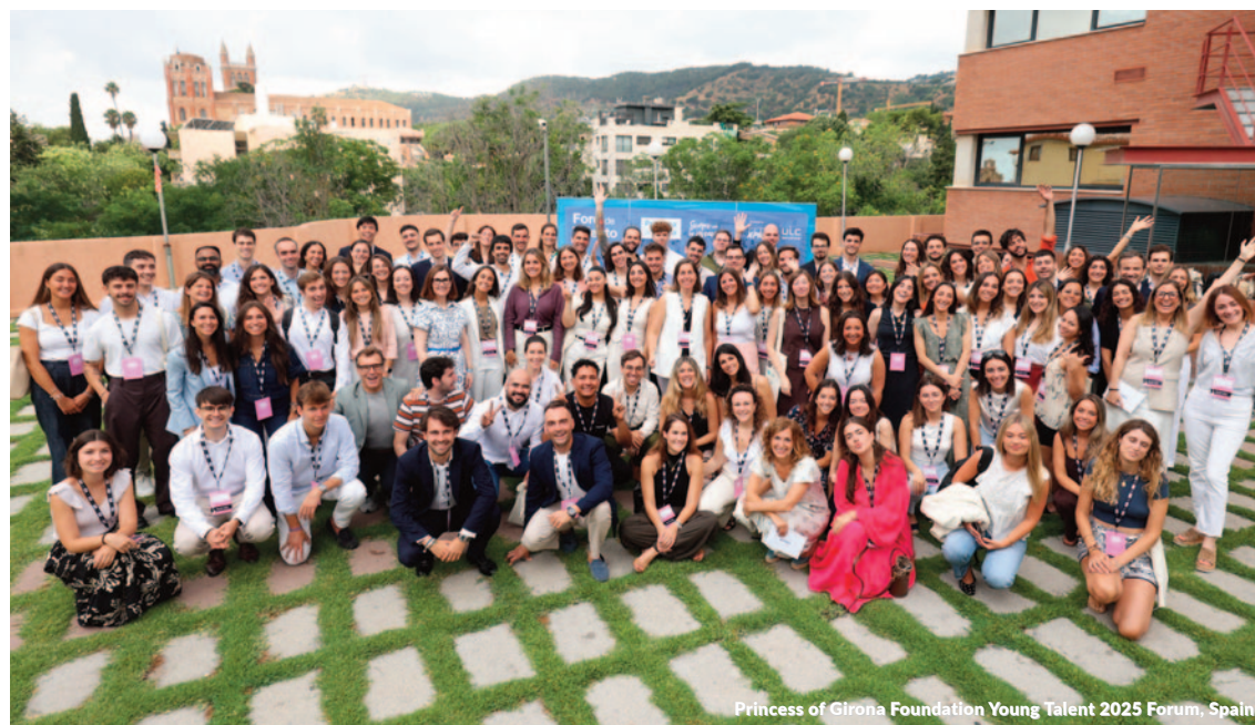
Princess of Girona Foundation Young Talent 2025 Forum, Spain