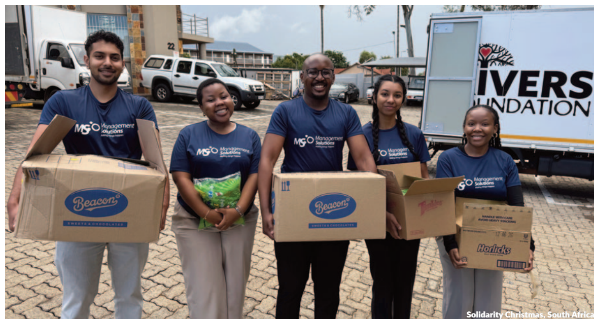
Solidarity Christmas, South Africa