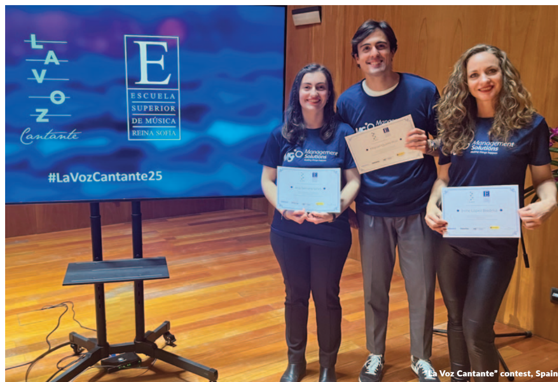
"La Voz Cantante" contest, Spain