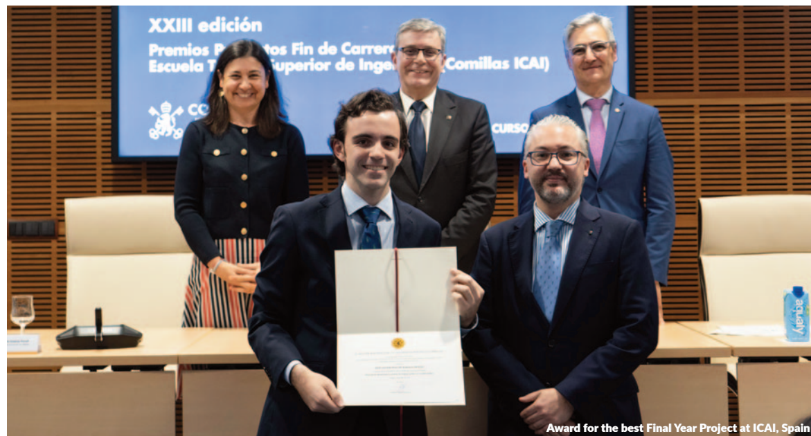
Award for the best Final Year Project at ICAI, Spain