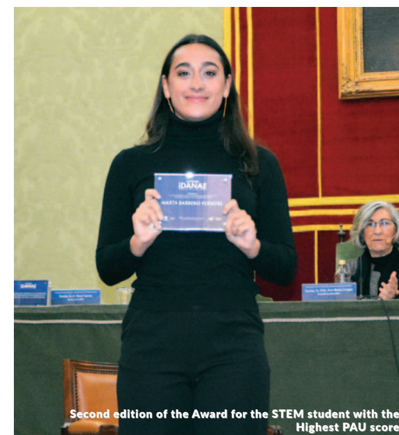
Second edition of the Award for the STEM student with the Highest PAU score