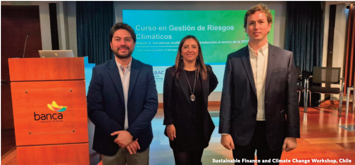
Sustainable Finance and Climate Change Workshop, Chile