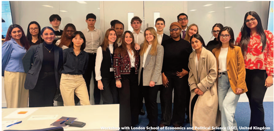
Workshop with London School of Economics and Political Science (LSE), United Kingdom

During the session, students had the opportunity to develop practical skills, become familiar with consulting methodologies, and tackle real business challenges through different case studies.