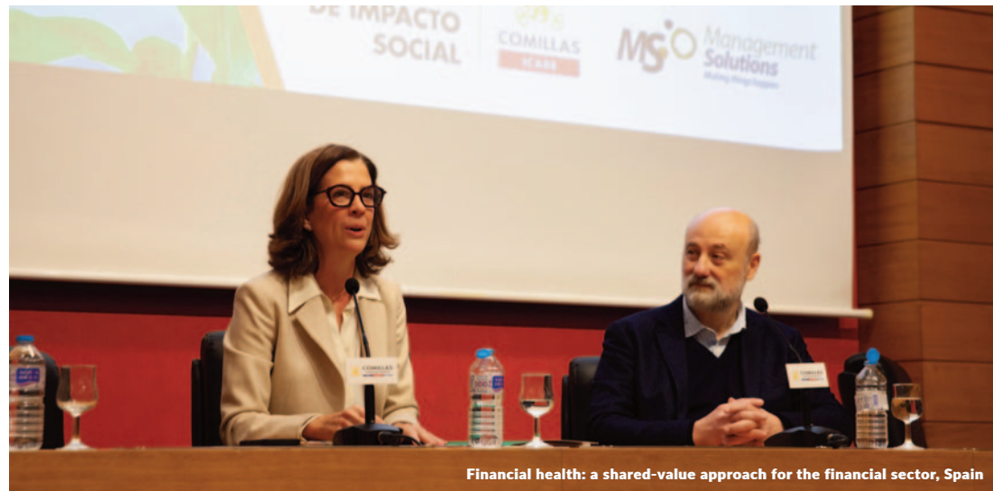
Financial health: a shared-value approach for the financial sector, Spain

Furthermore, the report presents widely used methodologies, including financial capability surveys, pre-post analysis, poverty indices and SROI, and outlines a set of practical indicators to measure progress in inclusion, resilience and financial wellbeing.