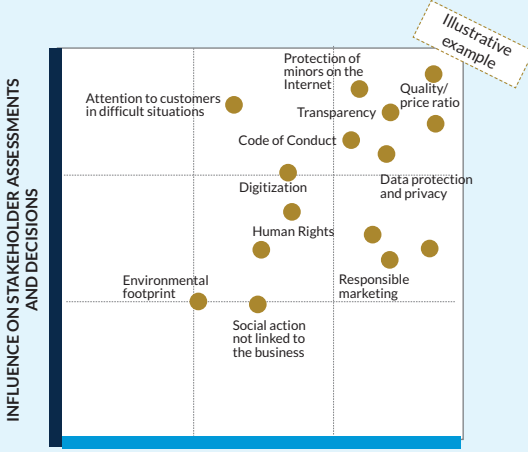
IMPORTANCE OF ECONOMIC, ENVIRONMENTAL AND SOCIAL IMPACTS

In cases where there are material aspects occurring outside the organization, indicators will be reported depending on the availability and quality of data.